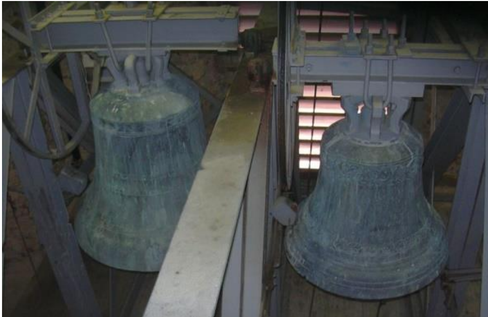
Figure 1: The big and the middle sized bell in February 2015 before reconditioning

The history of the Liedolsheim church bells is linked very often to acts of war. Therefore I am happy to write this article on an occasion, where not war, but normal wear makes reconditioning of the bells necessary. This need for reconditioning inspired the following summary of my research on the bells' history.