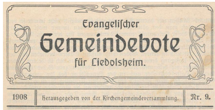
Figure 2: The parish newsletter, printed 1908 – 1913, brought news from Liedolsheim also to families in Cleveland, OH